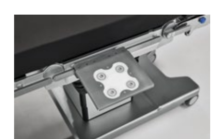
e) Tableside docking for remote control unit