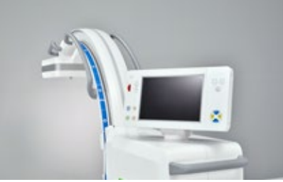
d) Mobile C-arm touch user interface/remote user interface