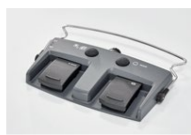
I) Wireless footswitch