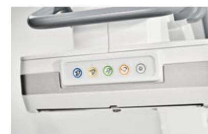
g) Mobile C-arm FD (front)