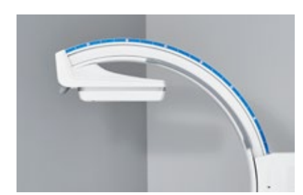
f) Mobile C-arm: FD from top, front to bottom

Note: The following workflow is based on the availability of fast-acting surface disinfectants and therefore works strictly from clean to dirty. If disinfectants with longer residence times are used, it may make sense for reasons of infection prevention to first disinfect surfaces near the patient and then the distant surfaces.