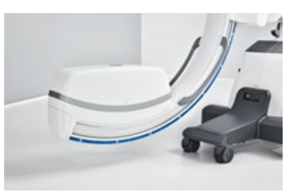
j) C-arm: single tank from top to bottom